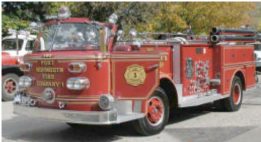
A vintage American LaFrance "Jersey Girl" from Port Monmouth now living in Illinois! Can we bring her home someday?

New Jersey Fire Museum & Fallen Firefighter's Memorial 175 Washington Street Long Branch NJ 07740