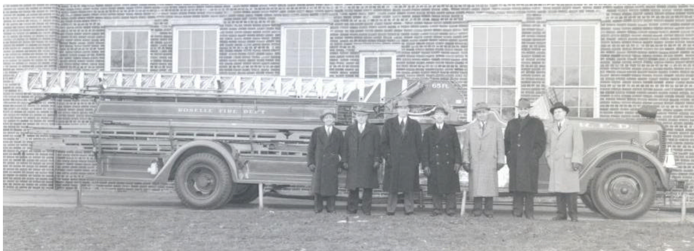
Roselle fire officials pose for a photo in December 1942 with their 65' aerial ladder truck. Since chrome plating was restricted to support the war, headlights, handrails and even hubcaps were plain metal, although it appears that Roselle managed to get a nickel or chromed bell! The lack of chrome trim gave rise to the name "plain Jane" for trucks delivered in this era.

The order was placed less than two months prior to the attack on Pearl Harbor and the original contract called for the apparatus to be delivered within about "One Hundred Fifty Working Days".