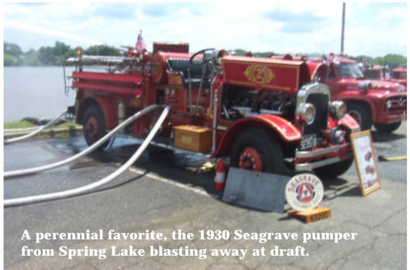
A perennial favorite, the 1930 Seagrave pumper from Spring Lake blasting away at draft.