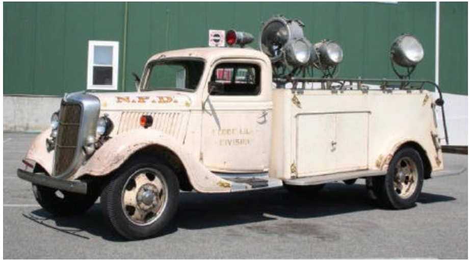
1936 Ford Floodlight rig with body built by Wendel Body Co of Newark NJ. Purpose built to bring ‘daylight’ to fire scenes, this rig was eventually retired from service as new apparatus were delivered with their own more powerful lighting equipment.

The crew worked on the ignition and points, acquired a battery, sent the fuel tank out