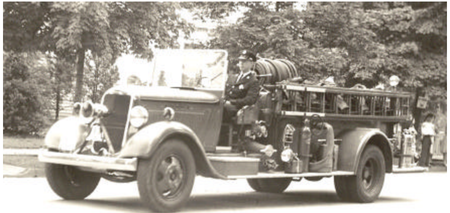
Photographed as it passed by in a summer parade many years ago is the 1930s vintage Ford pumper of Lakehurst, NJ. You've probably seen this rig before and didn't know it! She is seen in the newsreel coverage of the 1937 crash of the German zeppelin Hindenburg at Lakehurst NJ. It is said the rig carried a small zeppelin shaped marker to commemorate the event but the truck has since vanished into New Jersey history.

Please visit the museum website for all the details!