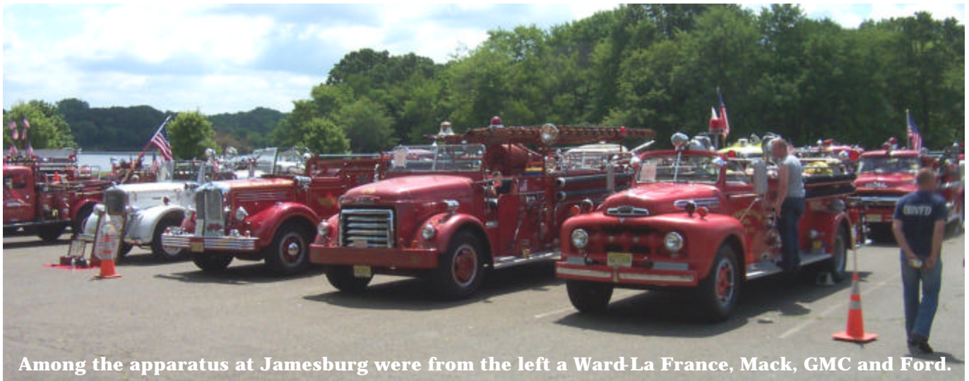
Among the apparatus at Jamesburg were from the left a Ward-La France, Mack, GMC and Ford.