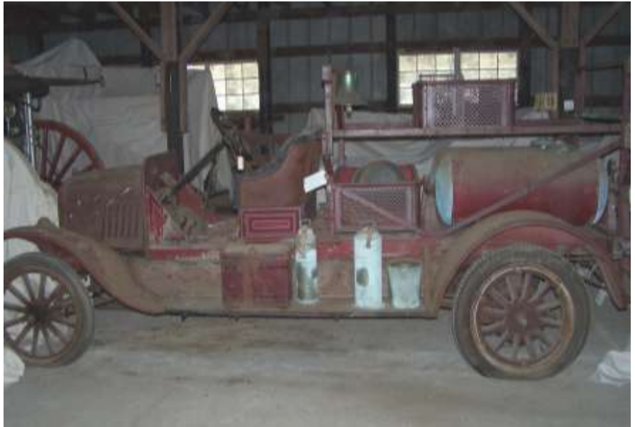
The sleeping beauties shown in the video include some of our hand drawn and horse drawn rigs as well as several motorized rigs. Shown above is a 1909 Model T from the New Jersey State Home for Boys, Jamesburg, NJ, that was part of the Ernie Day collection. Like many of the motorized rigs she will need restoration.

The video is currently on YouTube, and is available thru a link on our website, or at any of the events we attend. We can also provide you with a copy to present to your department.