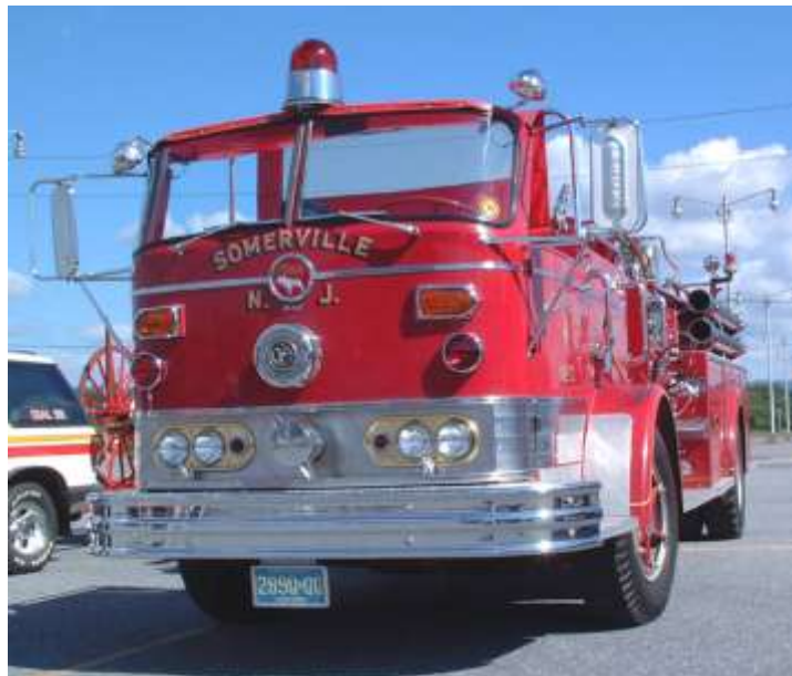
(Above) the 1960 Mack that now serves as our primary museum operating apparatus. She needs a crew and we invite you to participate in maintenance or operations!

Only the C model stands as a unique fire apparatus design from Mack. We are proud to have a classic rig with such fine pedigree as our ambassador to the public!