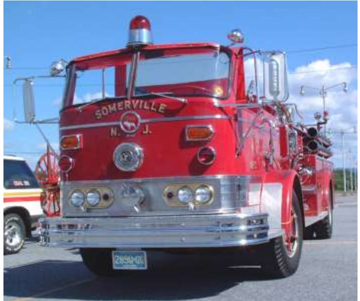
(Above) the 1960 Mack that now serves as our primary museum operating apparatus. She needs a crew and we invite you to participate in maintenance or operations!

Only the C model stands as a unique fire apparatus design from Mack. We are proud to have a classic rig with such fine pedigree as our ambassador to the public!